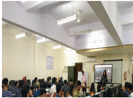
Organizer Addressing Participants